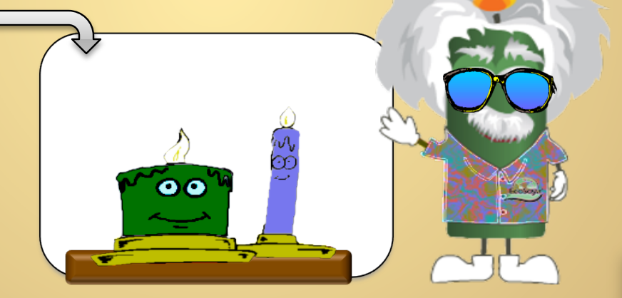
5. <u>COOL</u> ideally at <u>68-75°F</u> (20-23.9°C), spaced ½ inch apart.